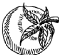
FIG N' PIG • 16 ROASTED FIGS • SHREDDED PORK • BALSAMIC ARUGULA • GOAT CHEESE

CAPRESE • 16 OVEN ROASTED TOMATOES • BURRATA CHEESE • TORN BASIL